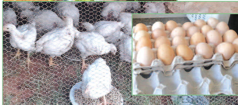
Our first harvest from chickens producing eggs