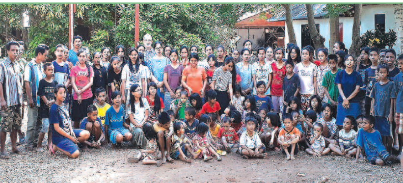
Children of the home