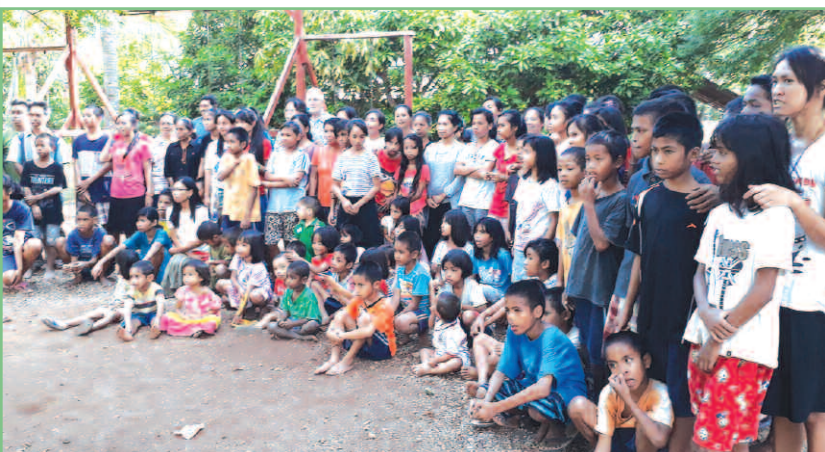
Students from outside the home