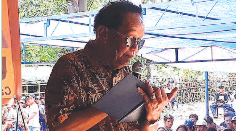
The king of TanaMbanas speaking at the rally