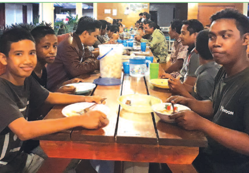
Evening meal with guests