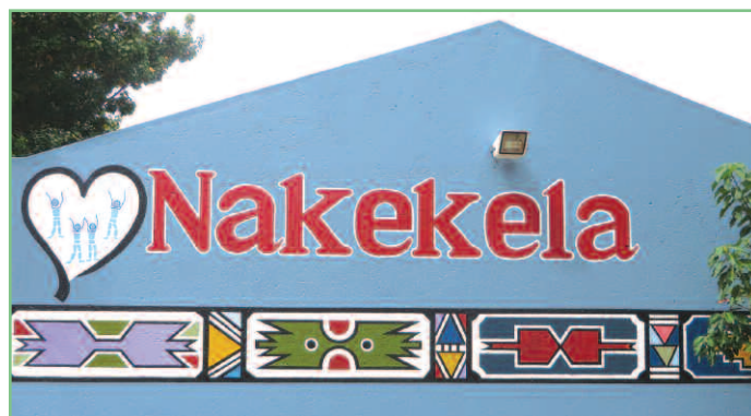
Nakekela Christian Community Centre in South Africa