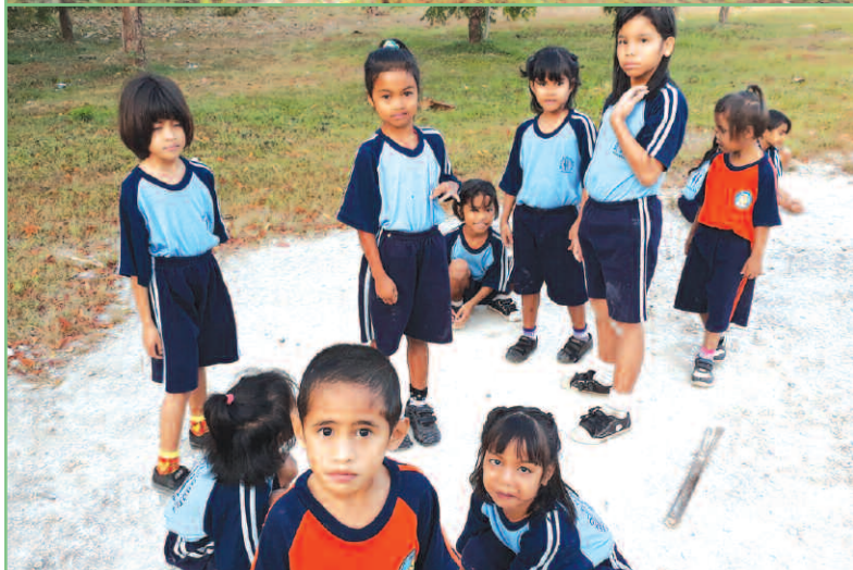
Early morning before school starts