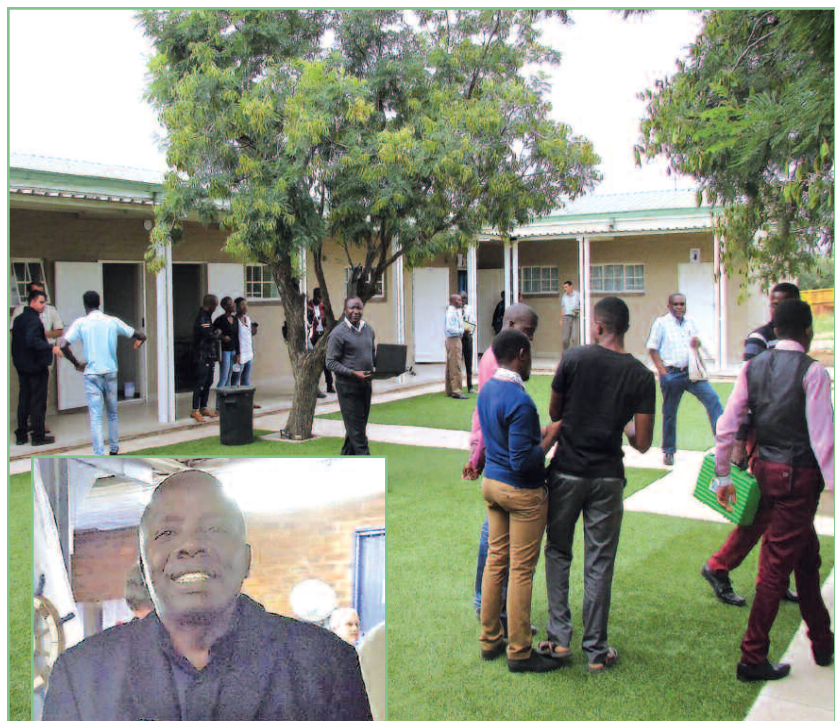
Students at the KwaMhlanga campus during a break

Please continue to pray for Mukhanyo's developing educational ministry. You can stay informed about what is happening by registering for our digital newsletter at www.mukhanyo.ac.za . Please pray especially for revival in churches across southern Africa – while we work hard for growth and positive results, God alone can give the increase and spiritual success upon our labors in His service.