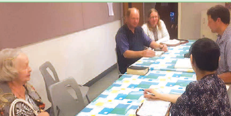
Bradford Bible Study

Please remember the Mission Committee in your prayers and in your financial giving. Your support continues to assist in spreading the light of the gospel of our Lord and Saviour, Jesus Christ, through this dark world.