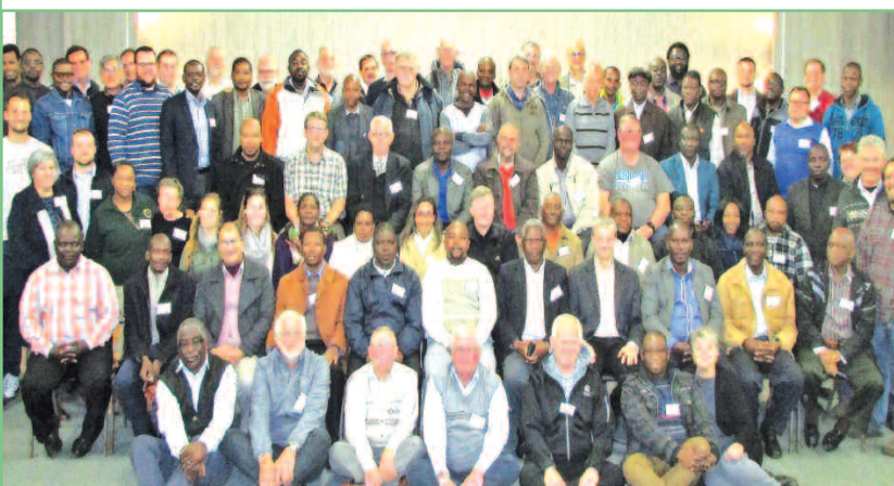
Participants at the Bible College Consultation 2018

I read somewhere in a preaching text book that you should never start a sermon with an apology because it usually means that the preacher has not done his homework. That being said, I nonetheless do begin with an apology for not providing an update for the last edition of Glad Tidings. So much has happened this past year, especially with regard to our future, that I simply overlooked the cut-off date.