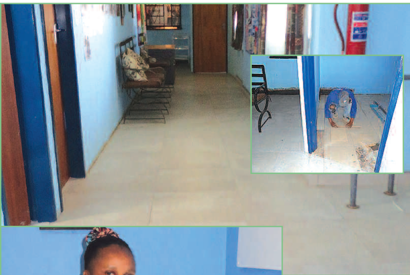
New Floor Tiles at Nakekela

Nakekela clinic is progressing wonderfully under the Lord's care and oversight. Donations from various individuals and churches have enabled us to repaint both the inside and outside of the building and tile the floors of the clinic, which were very slippery at times. The clinic is now a cheerful blue, chosen by the staff. The Ndebele artwork also has been redone giving the clinic a local cultural appearance. All work was done by local artisans.