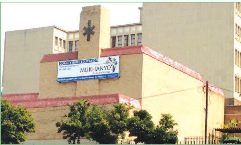
Johannesburg campus building in need of renovation