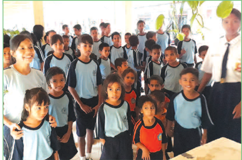
Lining up for class