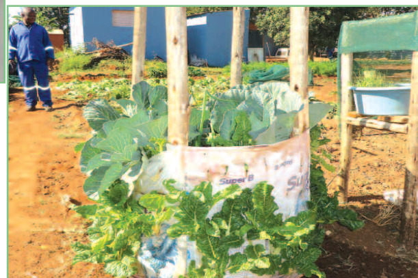
A tower garden