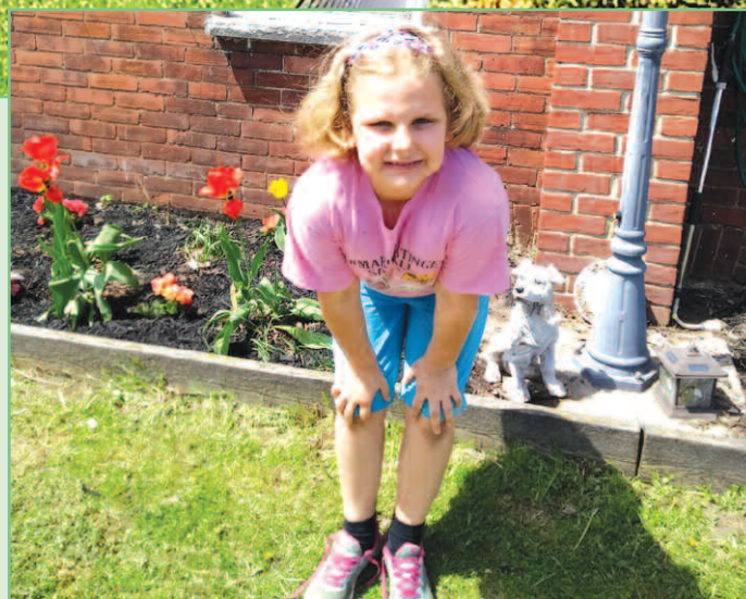
Gardening for the an elderly member