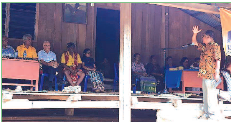
A place of honor